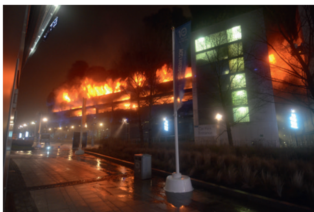
Figure 1. Fire at a multi-storey car park in Liverpool

It is thought that an old Land Rover was the cause of the fire, when it burst into flames. This quickly spread from vehicle to vehicle until all the vehicles were on fire [4, 5]. Figures 1–2 show the fire and its aftermaths.